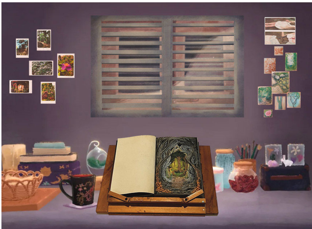
Library of Remnants by Shree Suvarna

https://esherblue.wixsite.com/project3v2